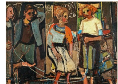
"Skipping" by Joan Eardley c.1950

Art expresses an individual, but also defines a society, its history, social events, perceptions and ideals. WDC has works that record local development in time and community and also procures significant works from further afield from which we can learn and enjoy. The fascinating collection of fine art by local and nationally important artists spans 300 years. This talk brings the collection to life through little known stories of the paintings and the artists who created them.. [Preceded by the AGM].