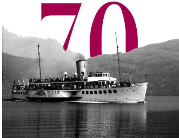
The Maid of the Loch turns 70 in 2023.

http://www.spanglefish.com/explorewestdunbartonshire/index.asp